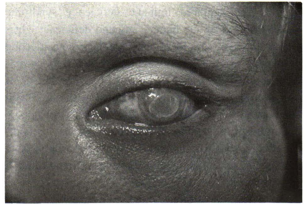
Figure 3,4 After five days of the treatment, the proptosis and chemosis decreased.

After five days of the above therapy the proptosis and chemosis decreased (Fig. 3,4). Evisceration was refused. The left eye became atrophic, the patient was lost to follow up.