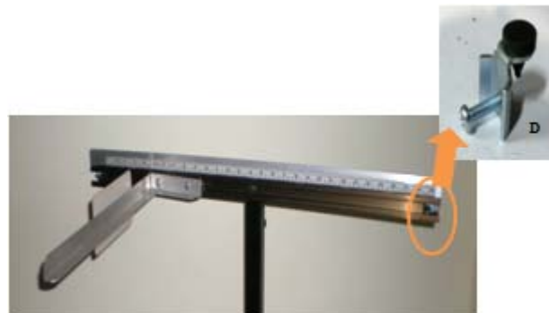
Figure 2. Measurement value track.