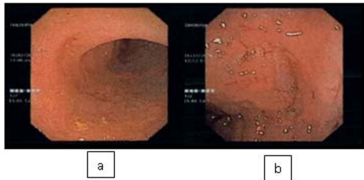
Figure 2. Colonoscopy showed inflamed colonic mucosa with multiple scattered shallow clean ulcers from rectum to transverse colon and in terminal ileum (a) terminal ileum (b) descending colon.